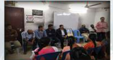
Teachers' Day Celebrations