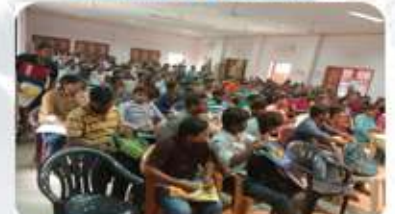
Classes by State Best Faculty