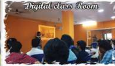
Digital Class Room