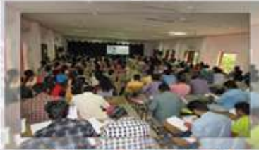
Students Taking WIN Test