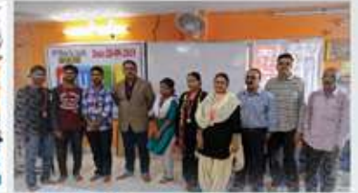
English Quiz - First time in India