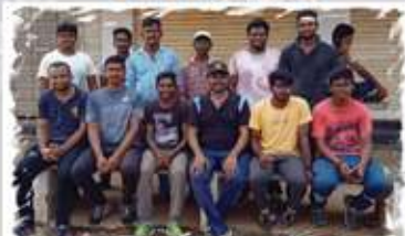
Students ready to play DPL