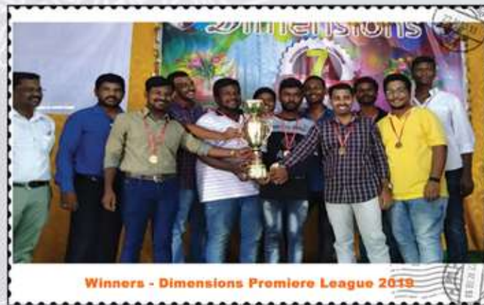
Winners - Dimensions Premiere League 2019